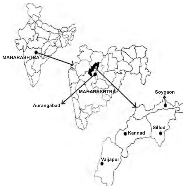
Fig. 1 — Location map of Aurangabad district showing study areas

attention from floristic point of view, it has remained practically untouched ethnobotanically. Keeping this view in mind, survey on ethno-therapeutics of some medicinal plants used among rural and tribal populace of Aurangabad district was undertaken.