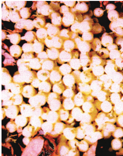
Madhuca indica (flowers)