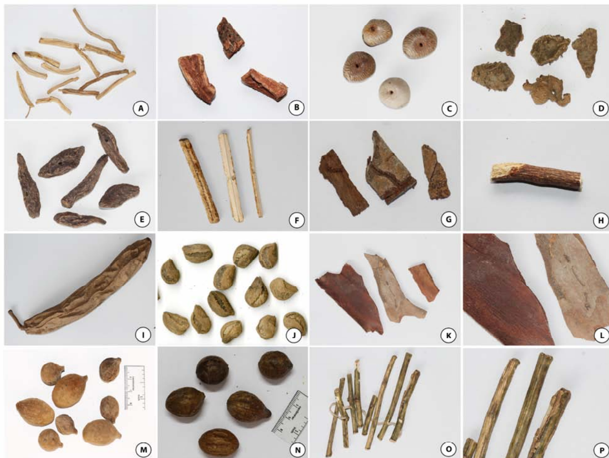
Fig. 2—A, Asparagus curillus Buch.-Ham. ex Roxb.; B, Bombax ceiba L.; C, Caesalpinia crista L.; D, Curcuma caesia Roxb.; E, Delphinium denudatum Wall. ex Hook.f. & Thomson; F, Eruca vesicaria (L.) Cav.; G, Ficus tinctoria subsp. gibbosa (Blume) Corner; H, Hybanthus enneaspermus (L.) F.Muell.; I-J, Kigelia africana (Lam.) Benth; K-L, Terminalia arjuna (Roxb. ex DC.) Wight & Arn.; M, Terminalia bellirica (Gaertn.) Roxb.; N, Terminalia chebula Retz.; O, Tinospora cordifolia (Willd.) Miers