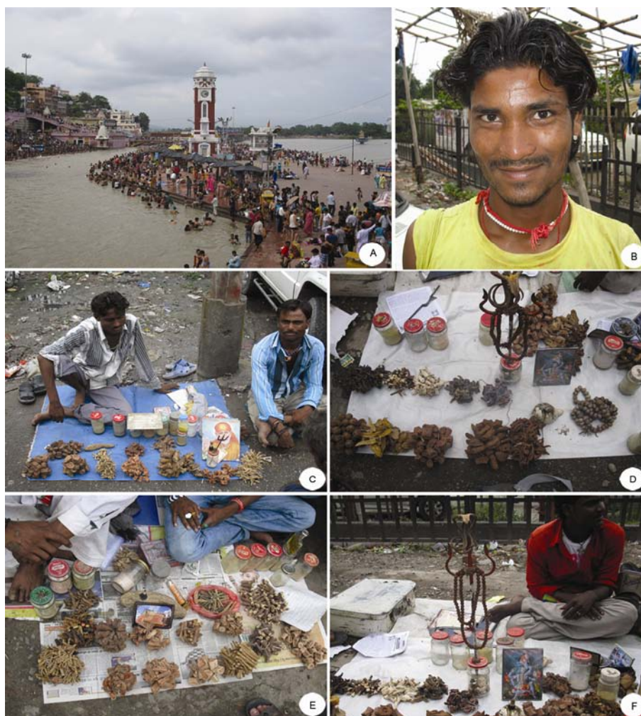
Fig. 1—A, Hari ki pauri; B, a vendor; C – F, vendors are selling crude drugs near Har ki pauri and railway station

author to determine the identities of species. Prior consent was taken and information about name of the drug, plant parts, and methods of remedy preparation, dosages and duration of treatment were recorded. In Haridwar, areas near Har-ki-pauri and railway station were selected because road side healers are common at these places. A total of 14 herbal healers were consulted and crude drugs were purchased. All the healers were male, aged between 22 - 37 yrs. Their ancestry is from Rajasthan and following the traditional family occupation. The healers collect plant part from wild and sell in road side market. The specimens of crude drugs were collected for identification. The specimens were identified with the help of relevant literatures 16 and by morphological and microscopic studies. Further, the specimens were match with authentic specimens preserved in Raw Materials Herbarium and Museum (RHMD), New Delhi. The botanical names of the plant specimens