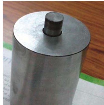
Fig. 2 — Compacted specimen ejection