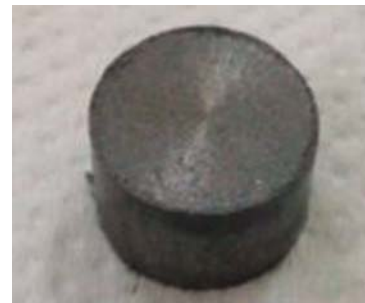
Fig. 3 — Compacted green specimen