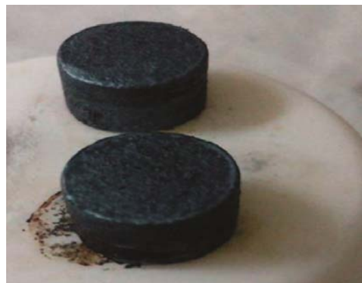
Fig. 4 — Sintered specimen