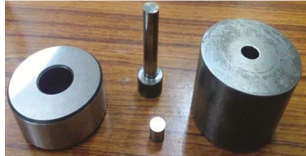
Fig. 1 — Metal die set for compaction

Various tests were conducted on steel EN24 specimens prepared by both powder metallurgy and heat treated as supplied plates in different quenching methods.