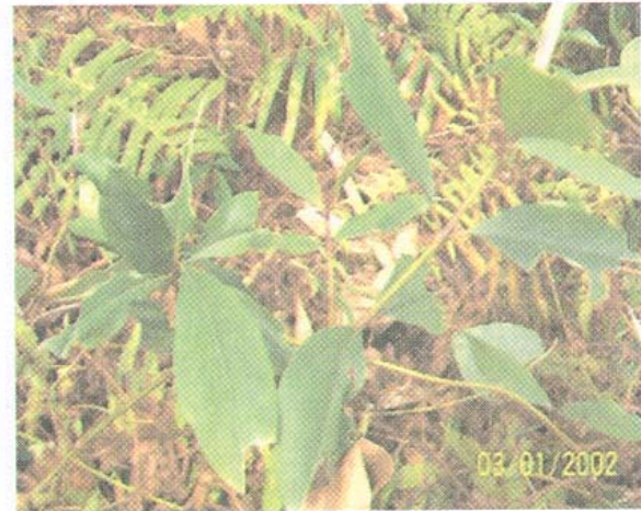
Fig. 5. Knoxia roxburghii (Spreng) M.A. Rau