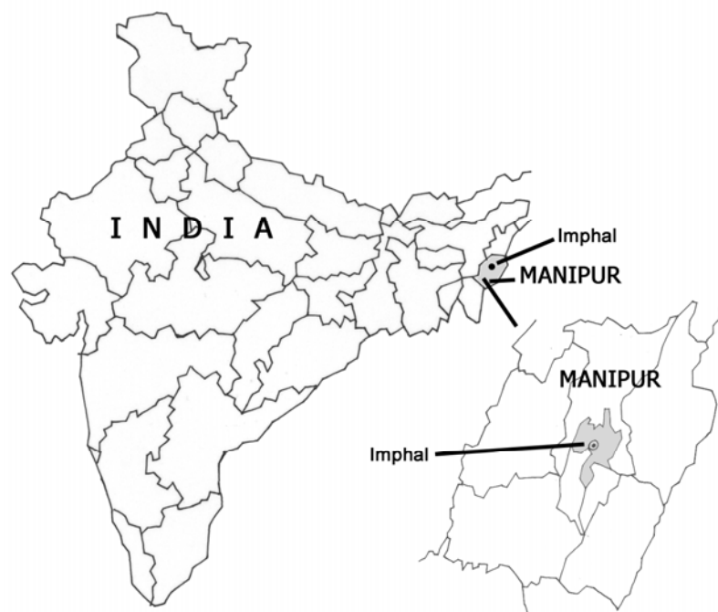
Fig. 1. Location Map of Manipur