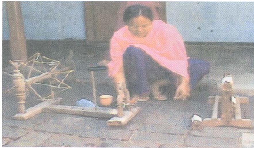
Fig. 7. Tareng naiba (Women spinning dyed thread from Bixa orellana Linn.)