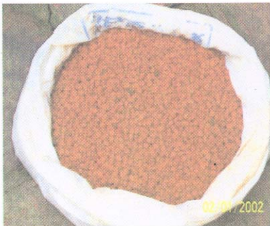
Fig. 4. Bixa orellana Linn. seeds