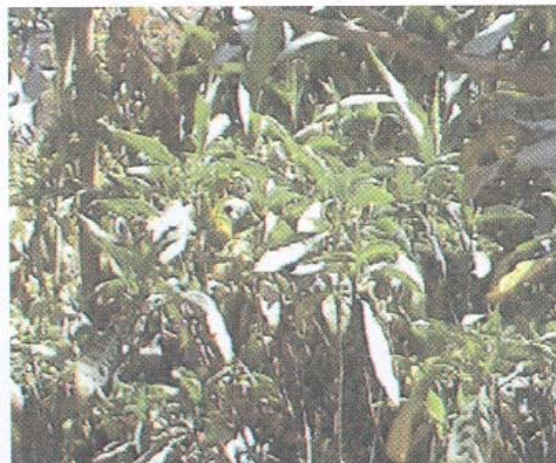
Fig. 6. Strobilanthes flaccidifolius Nees