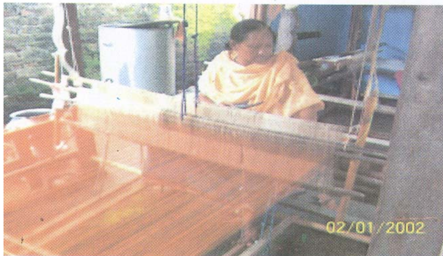
Fig. 9. Konda phisaba (Woman weaver dyeing cloth)