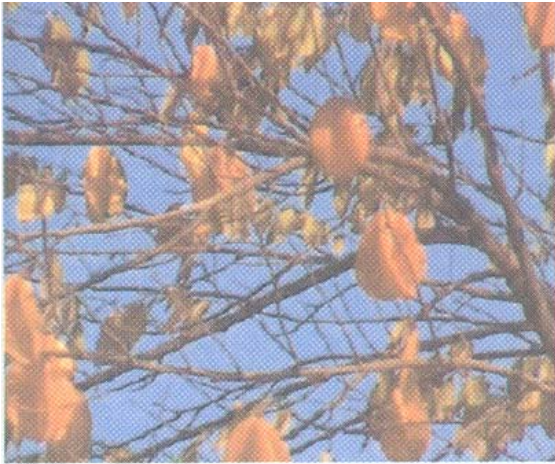
Fig. 2. Averrhoa carabola Linn.