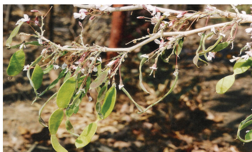
Ougenia oojeinensis -Flowering and fruiting