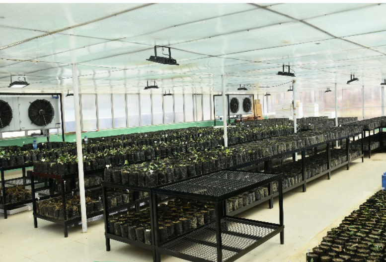
Heeng nursery (climate-controlled greenhouse facility)

Seed germination was a major constraint for nursery raising due to seed dormancy. Efforts were made at the institute to standardize seed germination through a series of experiments, and finally 60-70% seed germination was achieved for raising the planting material of Heeng . Efforts are being made to standardize tissue culture protocol for mass propagation of true to type planting material of Heeng .