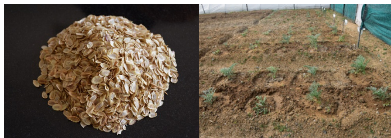
Heeng seeds (left) & Seed production centre (right)

Intending to achieve self-sufficiency in asafoetida production through widespread cultivation in India, team CSIR-IHBT, Palampur has been making relentless efforts since 2017 for the introduction of Heeng seeds from Iran, Afghanistan, Uzbekistan, Kazakhstan, and South Africa through