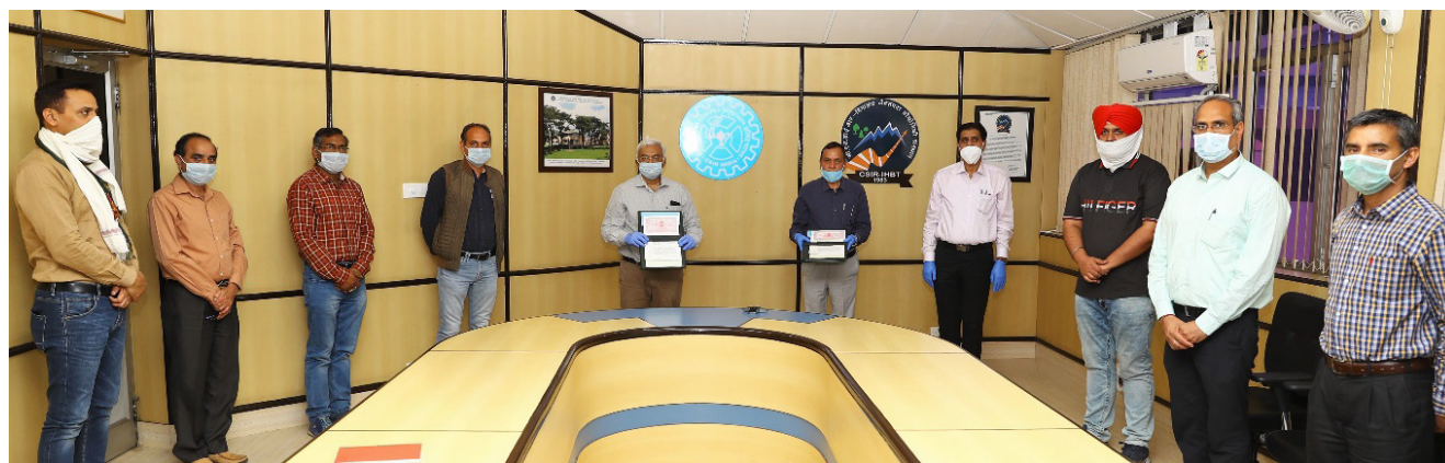
MoU signed with State Department of

Approximately 800 g seeds are required for the cultivation of Heeng in one hectare, depending upon the