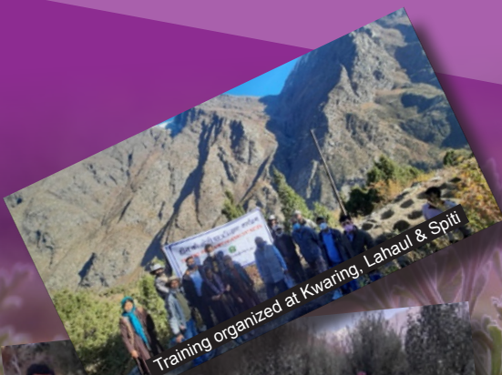
Training organised at Kwaring, Lahaul & Spiti