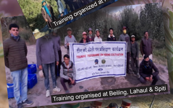
Training organised at Beiling, Lahaul & Spiti