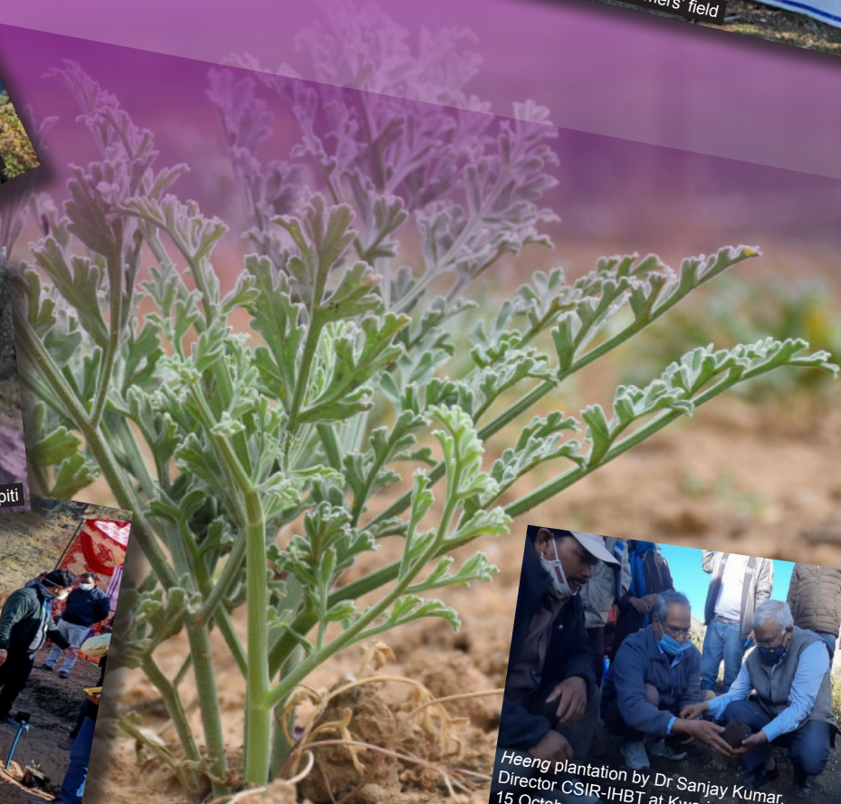
Heeng ( Ferula assa-foetida ) plant